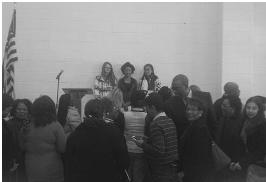
The young winners of the Martin Luther King Essay Contest received generous monetary prizes for their excellent essays. They read their essays at the Martin Luther King Breakfast.

philosophy of love expressed by Dr. Martin Luther King, Jr. Martin Luther King taught everyone how to overcome whatever obstacles they may encounter. The Martin Luther King Breakfast is sponsored annually by the Human Relations Commission.