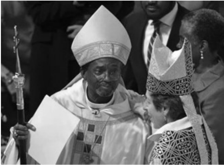
Bishop Curry with former Presiding Bishop Katharine Jefferts-Schori

Bishop Michael Curry was installed as Presiding Bishop of the Episcopal Church on All Saints' Day (Nov. 1) at the Washington National Cathedral.